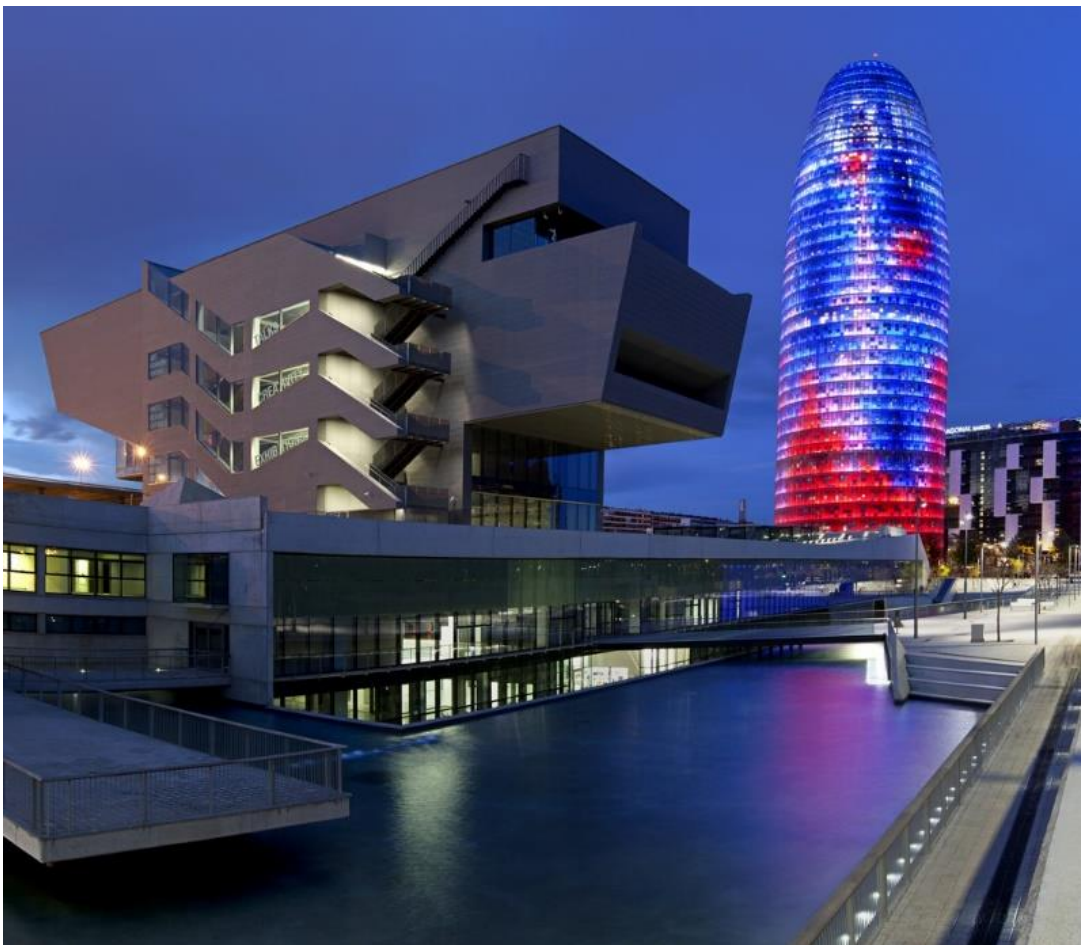
Disseny Hub Barcelona. Plaça de les Glòries Catalanes, 38, 08018 Barcelona

JOYA 2018 will take place on the October 04 th , 05 th and 06 th 2018 at Disseny Hub Barcelona, Spain.